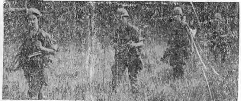
OFF WE GO — Equipped with gas masks and extra ammo, "White Warriors" of the 2nd Battalion, 12th Infantry leave a jungle command post to patrol the area surrounding the 3rd Brigade, 4th Division base camp.