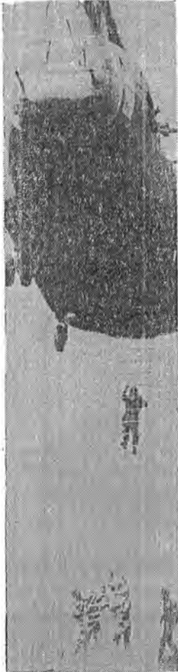
EASY? — This isn't the best way to board an aircraft, but on occasions 4th Division Ivymen prefer this method. This is a practice session, but often the jungle is so thick that a helicopter can't land and troops are evacuated or dropped by using the rope ladder.

"My wife and her mother get together to make packages for us," commented PFC Perez. "We get two or three a week."