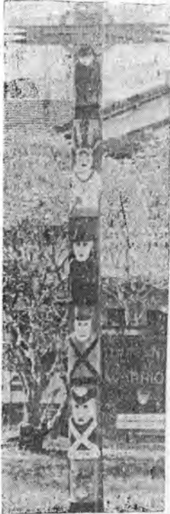
WELL-TRAVELED POLE — A totem pole shipped from Ft. Lewis, Wash., stands in front of the headquarters of the 2nd Battalion, 12th Infantry at the Dau Tieng base camp of the 3rd Brigade, 4th Division. The pole represents each war in which the 12th Infantry has participated.

Later events attest to the impression the battalion made on the villagers of Thanh An. Approximately 300 villagers left the hamlet for a village under government control and seven men turned themselves in as Hoi Chanh.