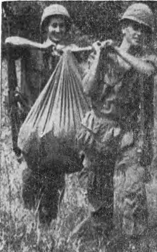
HAPPY CAPTORS — Big grins show the pleasure two "White Warriors" of the 2nd Battalion, 12th Infantry get from removing Viet Cong supplies found in War Zone C.